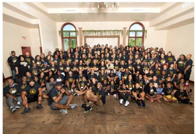
Alford Family Reunion July 9 th , 2018 Oklahoma City, Oklahoma